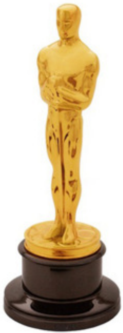
Employer of choice